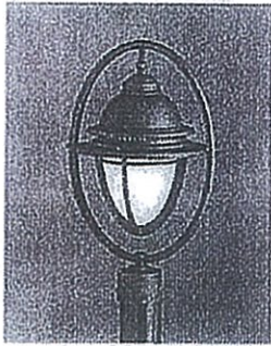
EXTERIOR LIGHTING FIXTURE